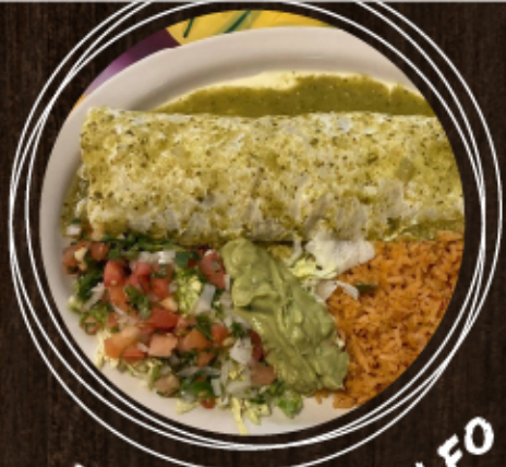
BURRITO DEL GOLFO

Two burritos, one shredded chicken and one ground beef with beans inside. Both burritos are topped with shredded cheese, salsa ranchera, lettuce, diced tomatoes and sour cream. 13.99