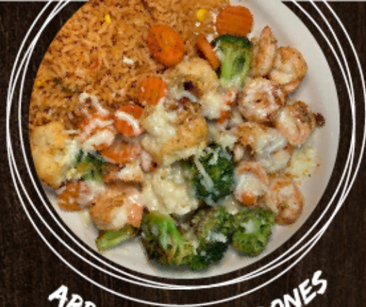
ARROZ CON CAMARONES